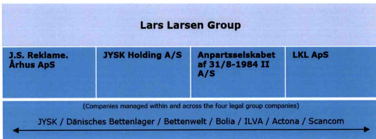
Figure 1 Lars Larsen Group (Companies encompassed by the Danish Financial Statements Act §99a and §99b).

Lars Larsen Group is, from an overall perspective, structured in three main layers. With reference to our annual reporting cf. The Danish Financial Statements Act §99a and §99b, below scheme illustrates the overall organizational structure of companies encompassed by our CSR reporting.