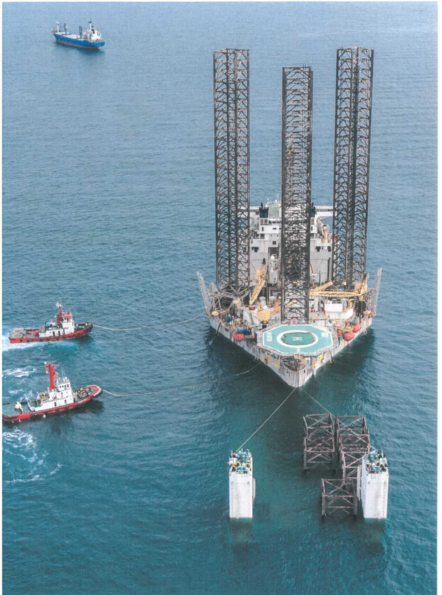
Oil, Gas & Industrial Projects