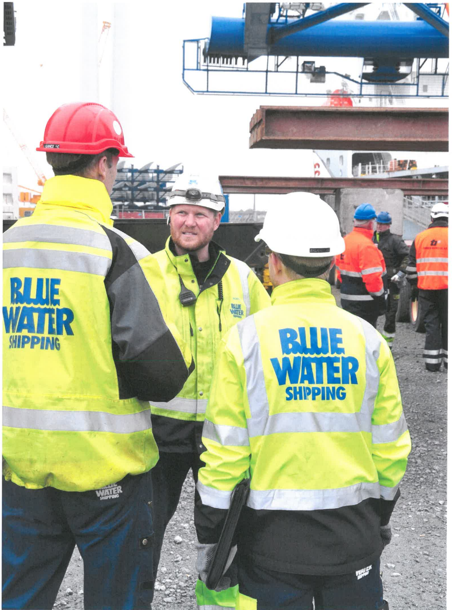
Port Services & Agency